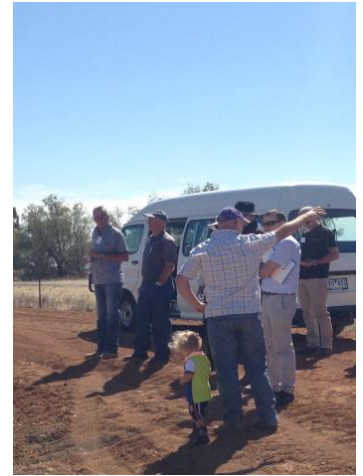
Group tour of the project