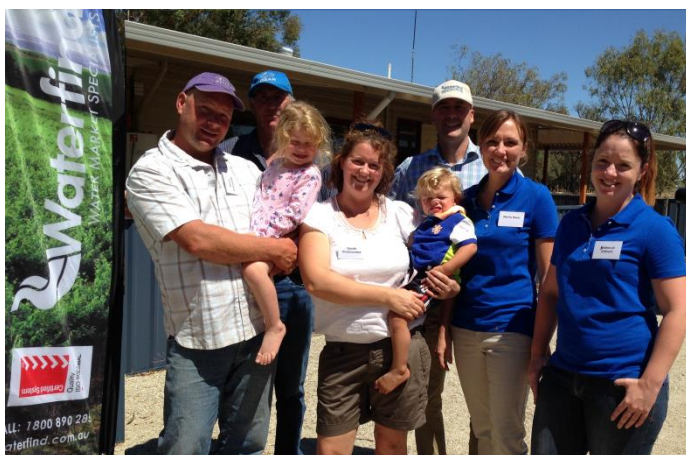
Waterfind Field Day