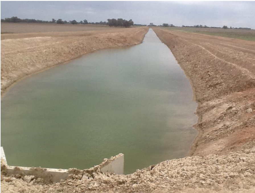
Drainage sump near Deniliquin, New South Wales. Site where pump will be installed.

Waterfind's proponents have been working extensively on projects across New South Wales, Victoria and South Australia. Through this time, many of them have come across points to consider when completing works.